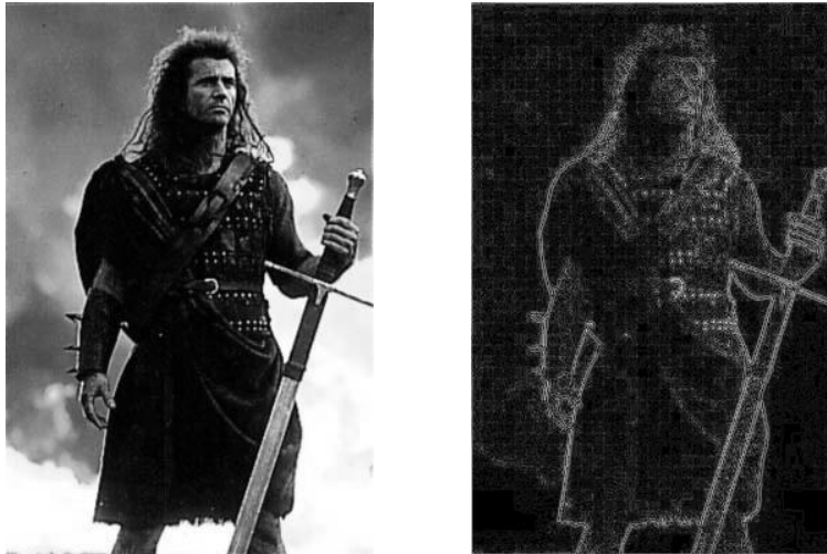
Figure 1: Result of simple edge detection